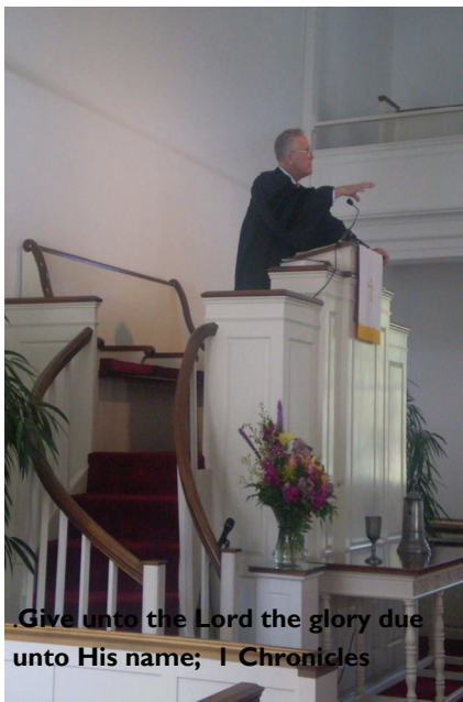
Give unto the Lord the glory due unto His name; | Chronicles